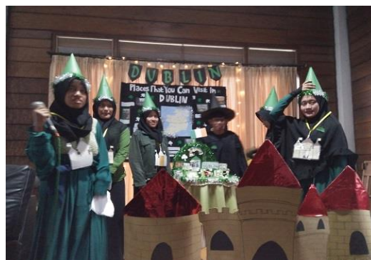
Figure 2. Dublin group Presenting Dublin's Cultures

This learning activity is packaged in the form of cross-cultural storefronts. After each group has finished preparing their stationary, ECP participants observe, interview and take notes as a result of group reports in turn. From this activity students can understand cross-cultural performance in the architecture of buildings, culinary, fashion, habits and beliefs. It can build and get different perspectives from different cultures (Yano, 2006). Cross-cultural storefronts can socialize various cultures and sensitize ECP participants to develop cross-cultural based ideas in written form.