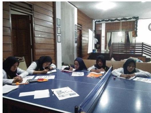
Figure 6 Individual work

The third, the content of the text communicates between knowledge and real life such as making essays about the difference between a sitting toilet with a squat toilet and others (Tseng, 2017), and (4) emphasizing a comprehensive writing which includes grammar, vocabulary, content, mechanics, cohesion, coherence and others (Shukri, 2014). In this case, there are around 30% of participants have weak score in mechanical and cohesion aspects. While there are 70% participants are good in the generally evaluation results of all aspects in writing.