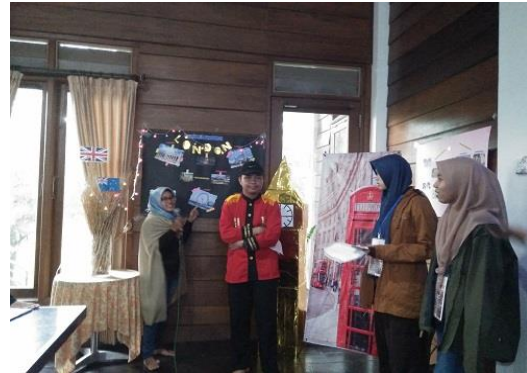
Figure 4 Observation and interview

Therefore, learning English related across cultures can make it easier for ECP participants to communicate in English specially on writing skills, because ECP participants are automatically encouraged to access various references in writing, enrichment of knowledge and experience in social life (Buttaro, 2004).