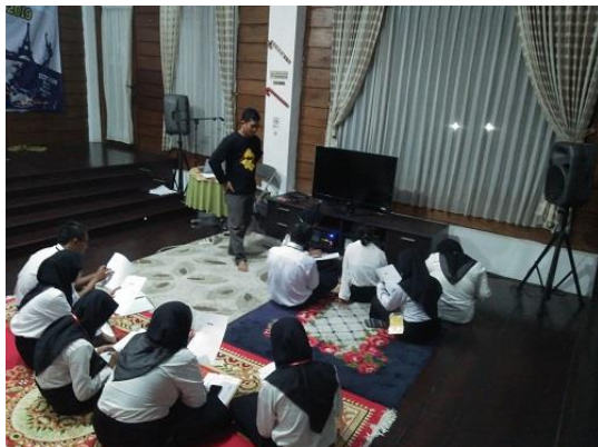
Figure 5 Group work

The results of reading various literatures, observations of cultural storefronts and structurally interviews, participants of ECP activities are able to express cross-cultural ideas into written text (Ekstam, 2014) dengan cara: considering : The first, making all activities that examine cultural diversity as a reference to the contents of writing . The second, the suitability of references to topics that have been determined and easily understood both within their own groups and other groups, because the references used reflect about each city such as Melbourne street art, Fiesta in Mexico, Whitehouse in London and outside culture that have become parts of daily life, such as how to eat, how to defecate and others.