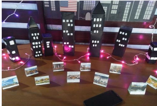
Figure 3 Storefronts of cultures