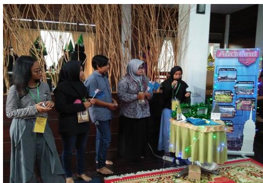
Figure 1. Auckland group Presenting New Zealand's Cultures