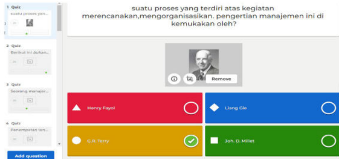
Figure 1. The Display Design of the Kahoot-Based Evaluation Tool

Furthermore (Figure 2) shows the final results of student achievement scores after evaluating learning using a kahot-based evaluation tool are as follows: