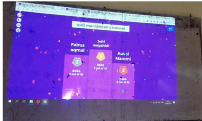
Figure 2. The Results of The Highest Score of Students

Furthermore (Figure 2) shows the final results of student achievement scores after evaluating learning using a kahot-based evaluation tool are as follows: