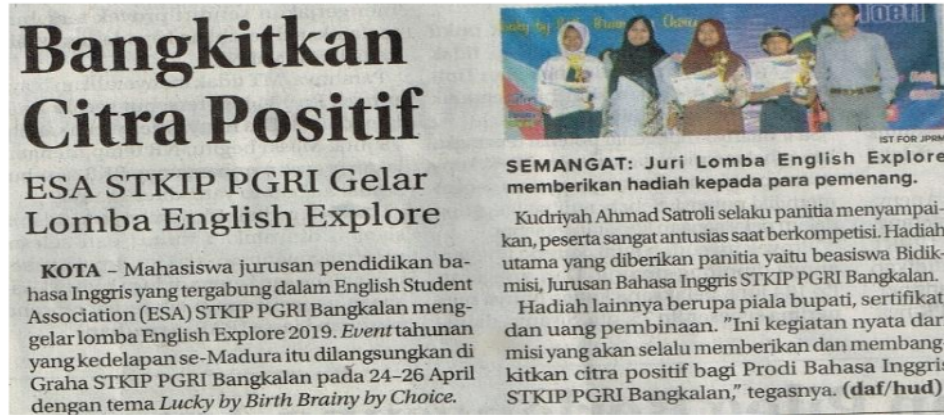
Figure 2. First Article of Radar Madura