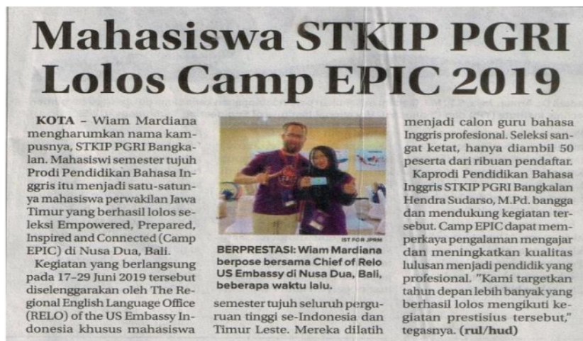
Figure 3. Second article of Radar Madura