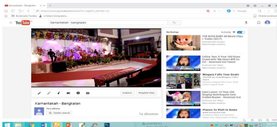
Figure 1: Kamantakah Dance - Bangkalan

The findings show that the second semester students are accustomed to accessing various kinds of familiar topics related to their daily life. They mainly search videos of hijab tutorial, music and tourist destination. Most of them prefer to watch videos narrated in Bahasa Indonesia. Exposure to language can affect their ability in English. As English department students they should have good command in English. YouTube videos with English narration could be integrated in the teaching and learning of English. It stimulates the students practice English. The lecturers tried to explore new topics by accessing YouTube. The lecturers used Madura Traditional dances videos. The videos present of the philosophy and the moment when the dances performed. The following are the images of the dances: